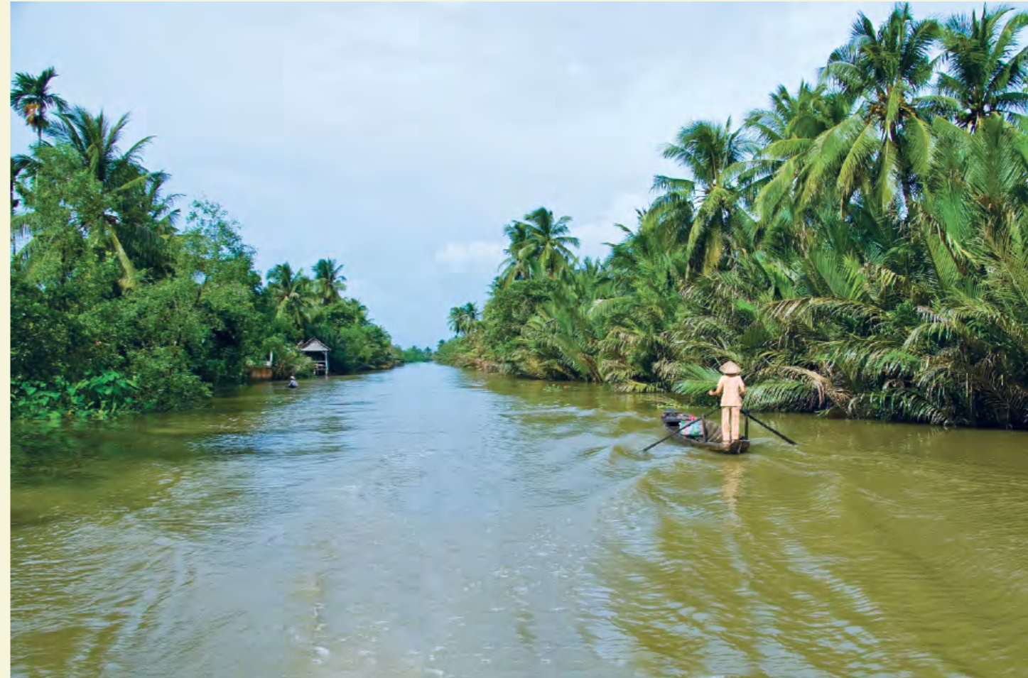
CANAL - CAN THO