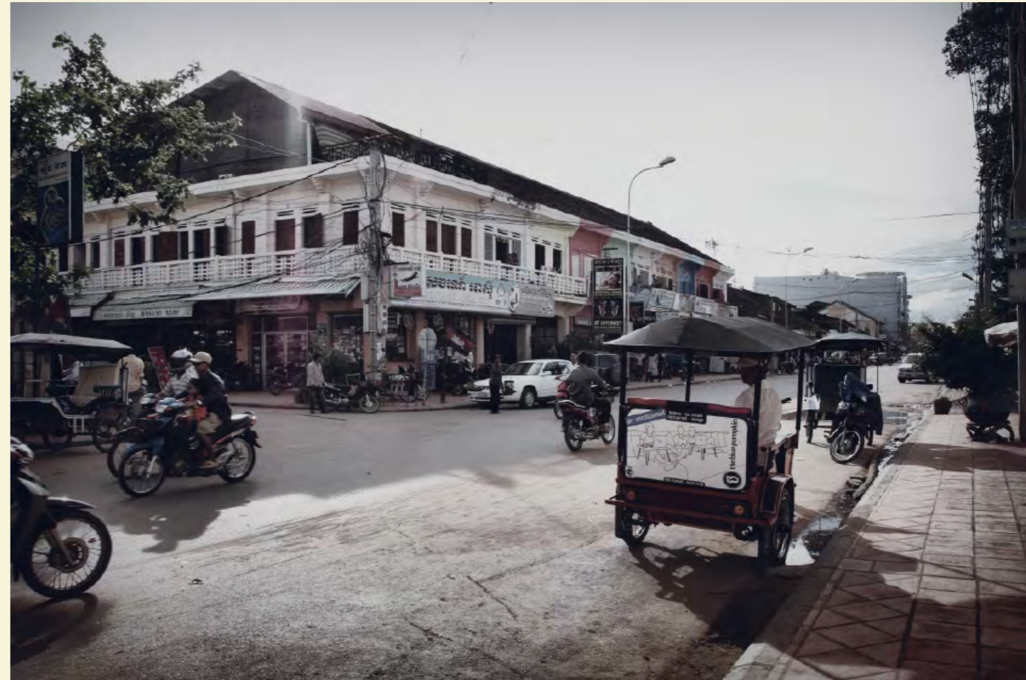
SIEM REAP TOWN