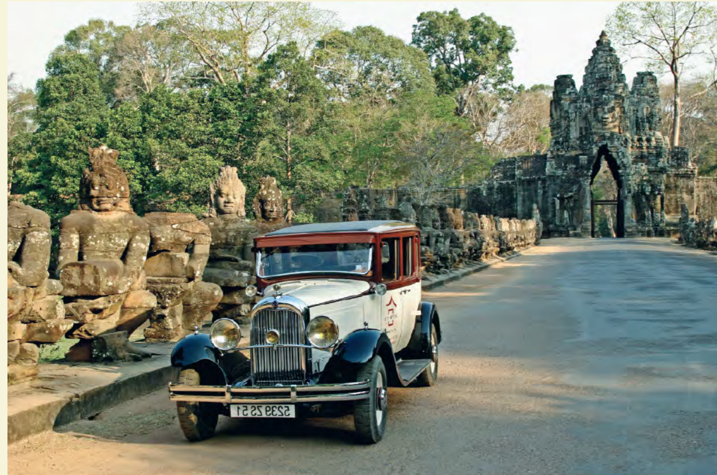
VICTORIA VINTAGE CITROEN

In 2006 , Victoria invested US$ 3 million in Phan Thiet and renovated the entire resort. Rooms were enlarged significantly to include outdoor showers and bigger private terraces; additional units were added: deluxe bungalows and new pool villas with 2-3 bedrooms. A large outdoor infinity-edge pool was also added to the spacious grounds.