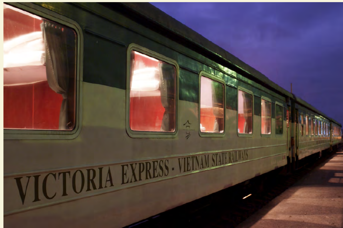
VICTORIA EXPRESS TRAIN