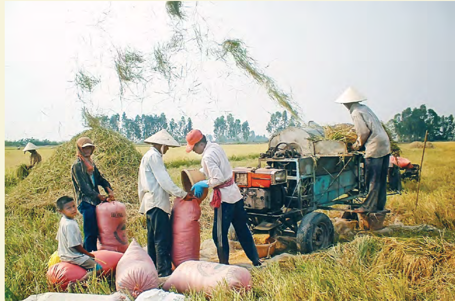
CAN THO FIELD