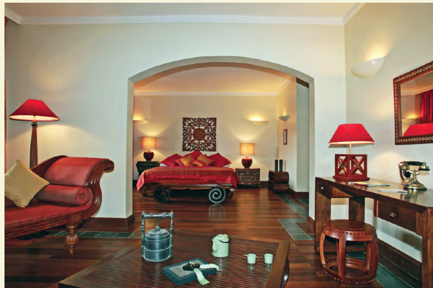
TA PHROM SUITE ROOM