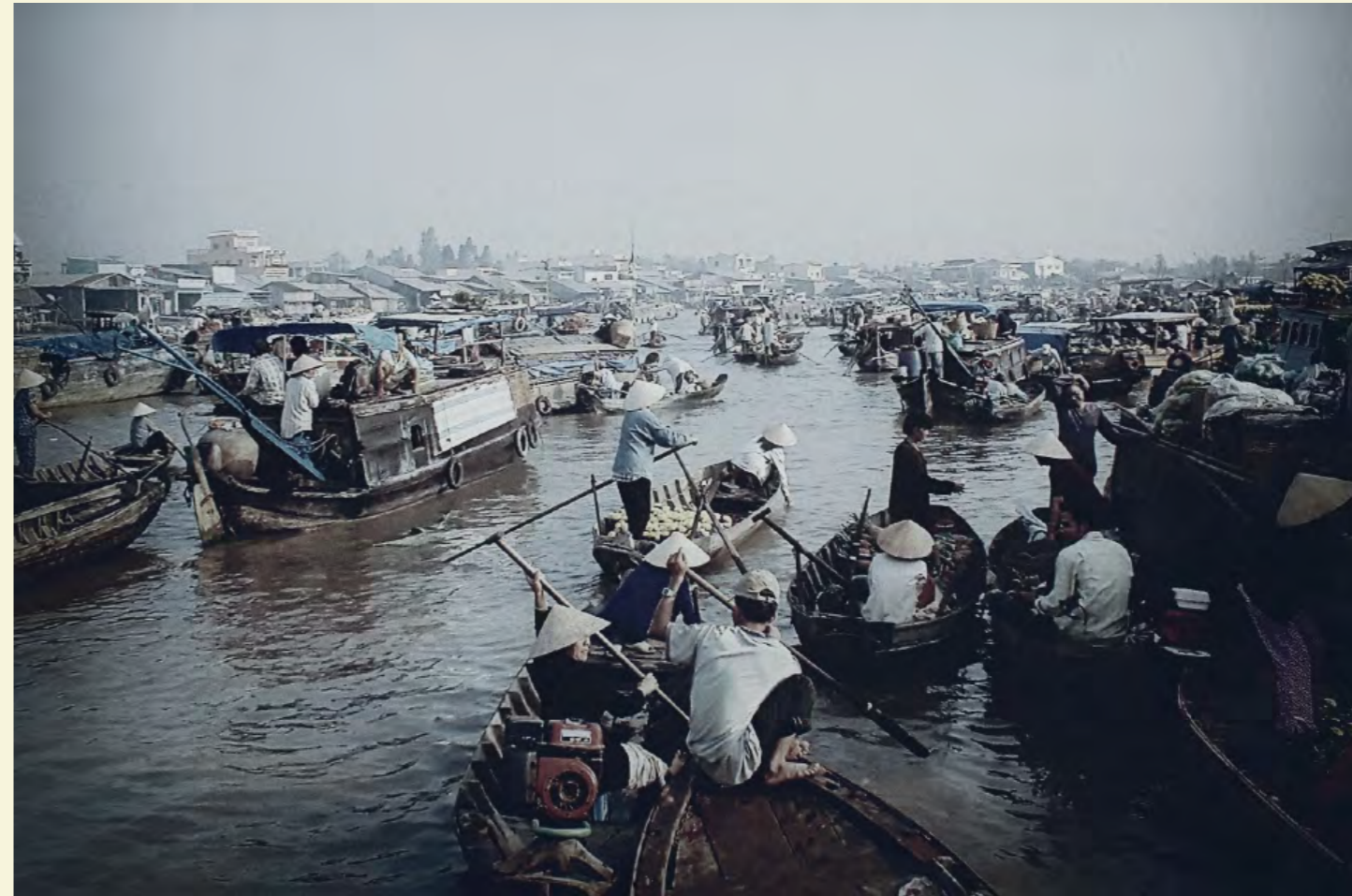
CAI RANG FLOATING MARKET