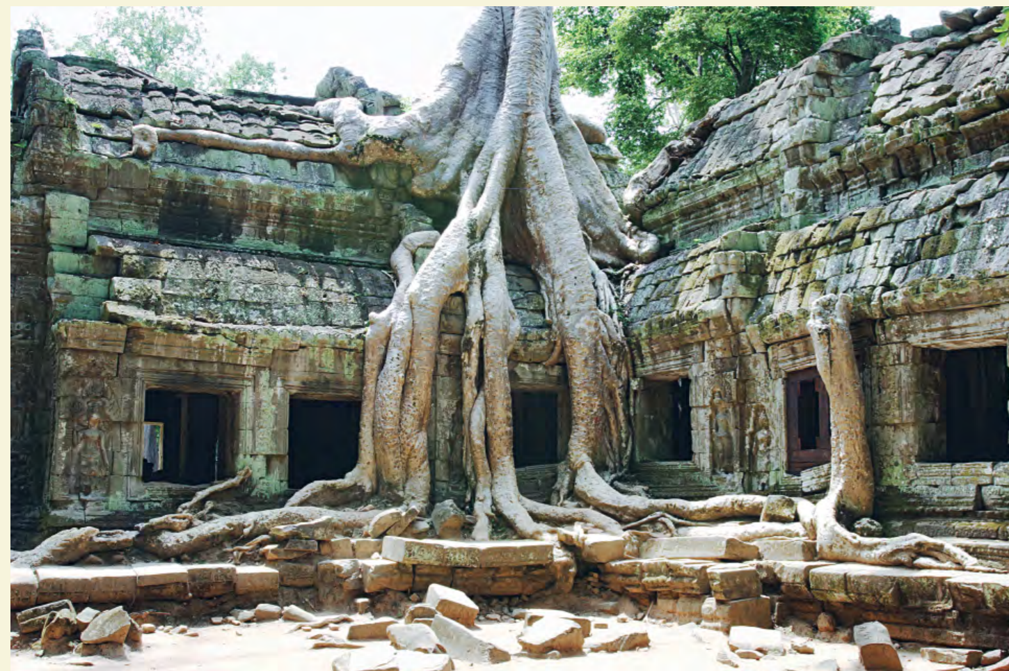
TA PHROM TEMPLE