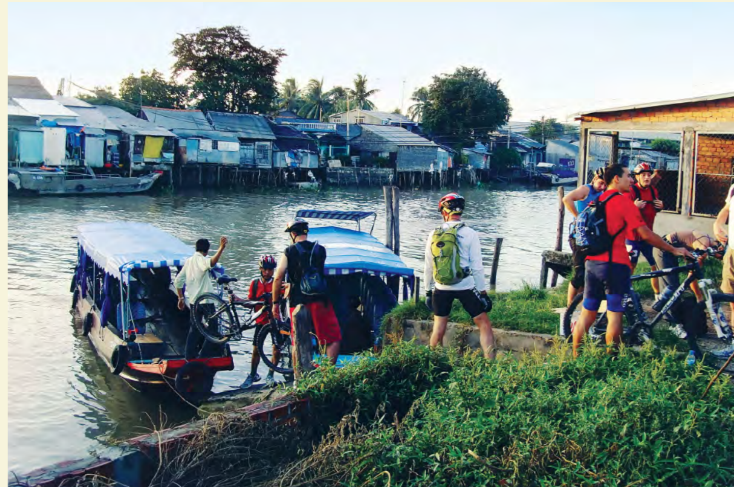
COUNTRY SIDE BIKING

The Lady Hau is the ultimate way to visit the delta tributaries with an early morning breakfast cruise or over a romantic sunset cocktail. It is a replica of a typical traditional rice barge used over generations by the locals to transport their rice grains to the city. There is a spacious deck onboard that is suitable for private caterings and events up to 40 persons.