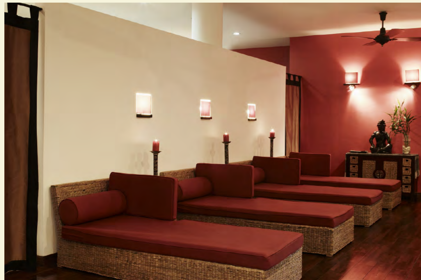
VICTORIA SPA SAPA