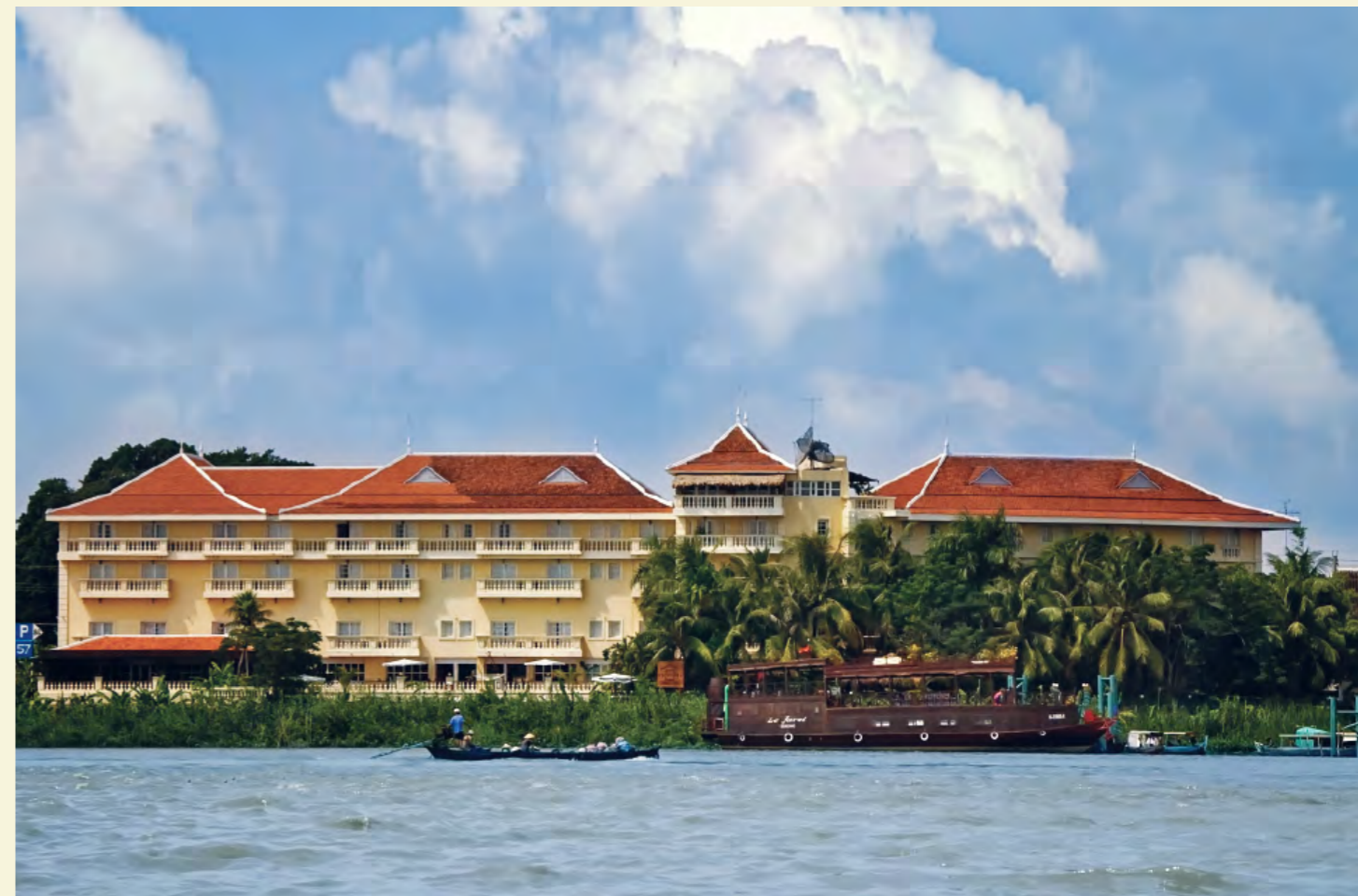
VICTORIA CHAU DOC HOTEL

1 Le Loi Street Chau Doc Town, An Giang Vietnam Tel: +84 76 3865 010 Fax: +84 76 3865 020 Email: resa.chaudoc@victoriahotels.asia