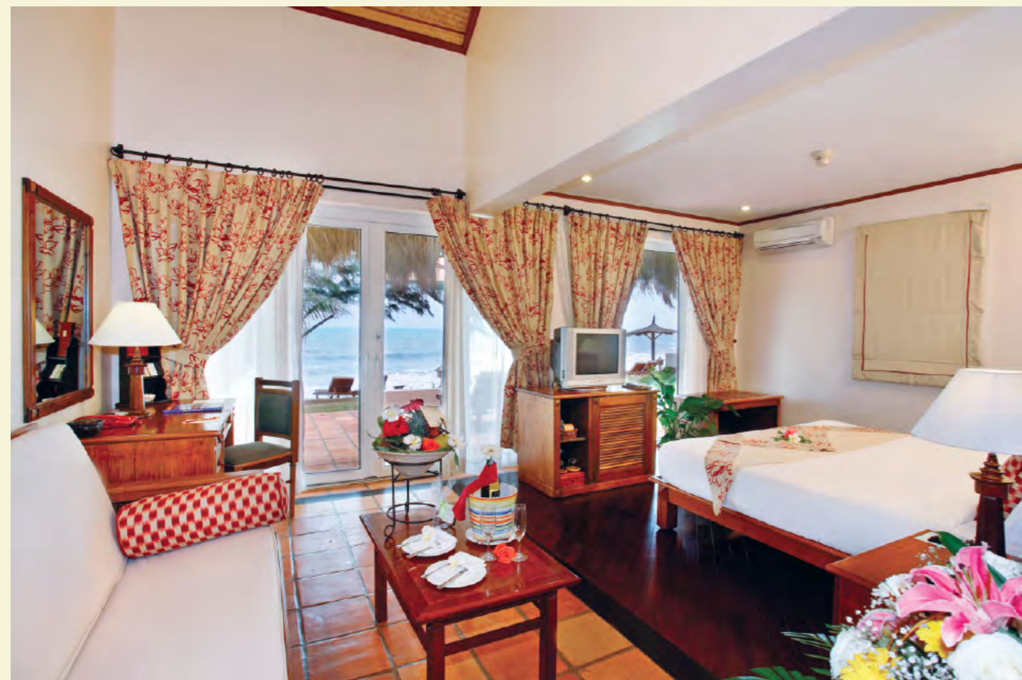
BEACH FRONT BUNGALOW