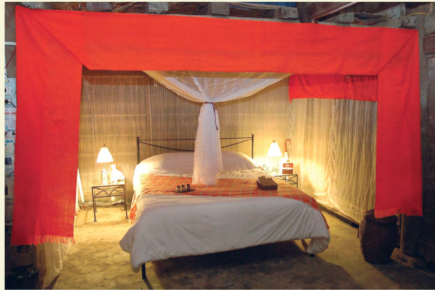
MUONG HUM HOME-STAY WITH VICTORIA SET-UP