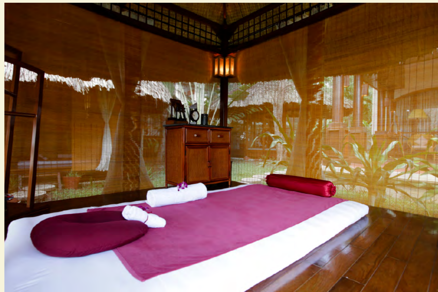
VICTORIA SPA CAN THO