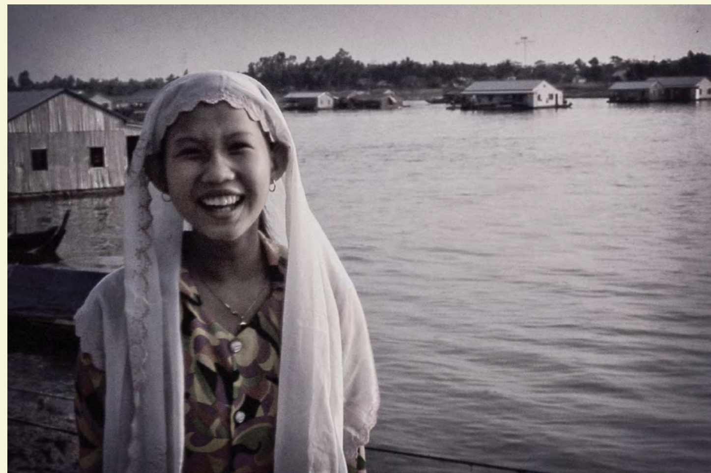
CHAU DOC FLOATING FISH FARM