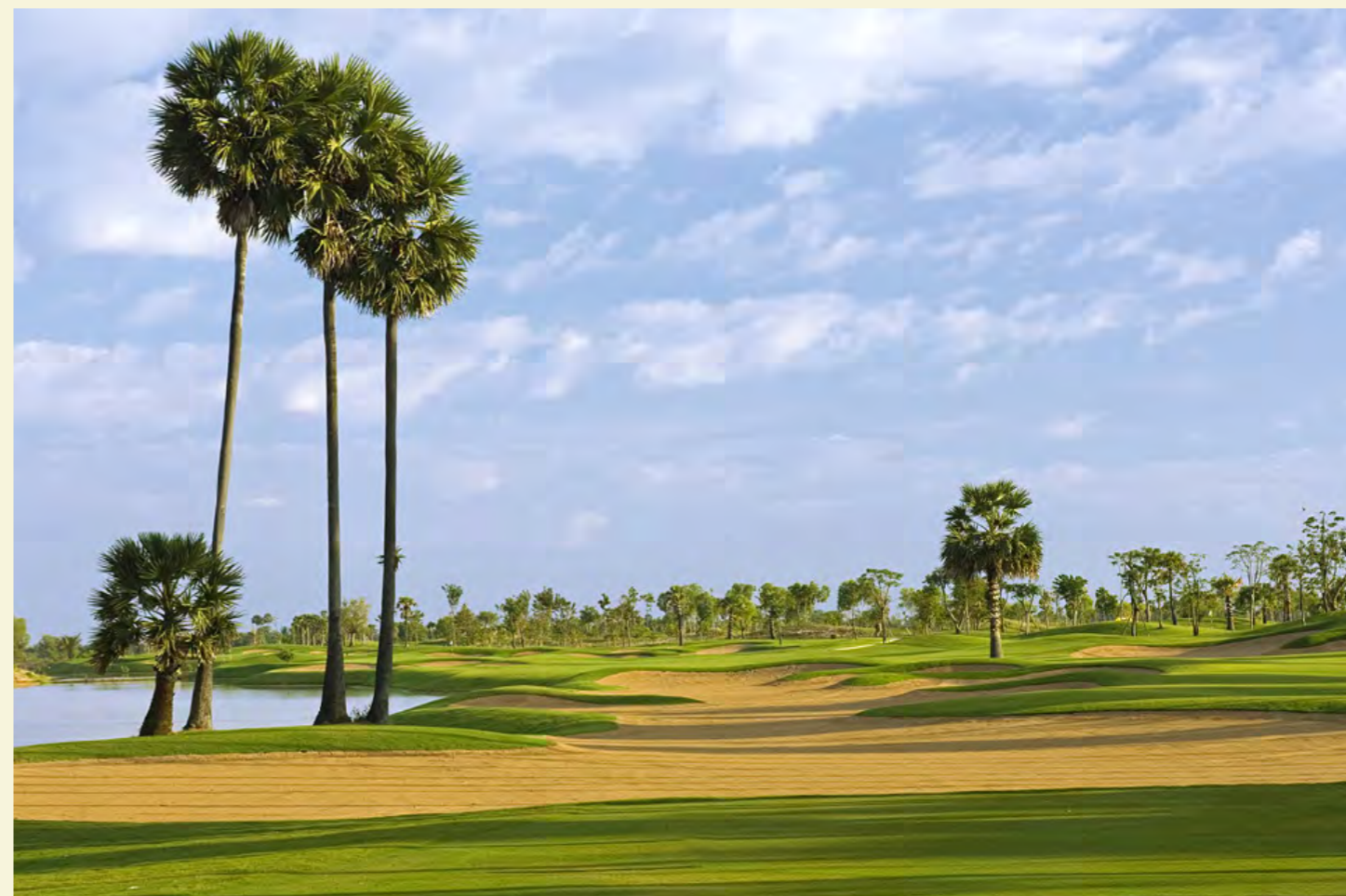
GOLF AT ANGKOR