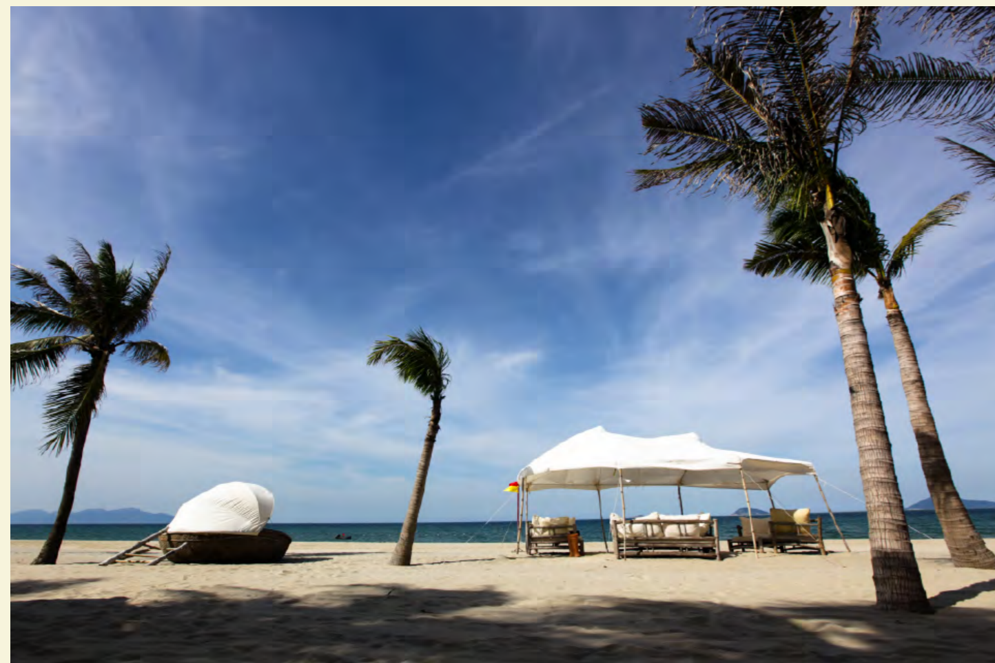
HOI AN BEACH

On the 1st floor, the Elephant Bar has a beautiful terrace, ideal for a relaxing break while having delicious cocktails or playing billiards, and a big screen broadcasting events for sport fans.