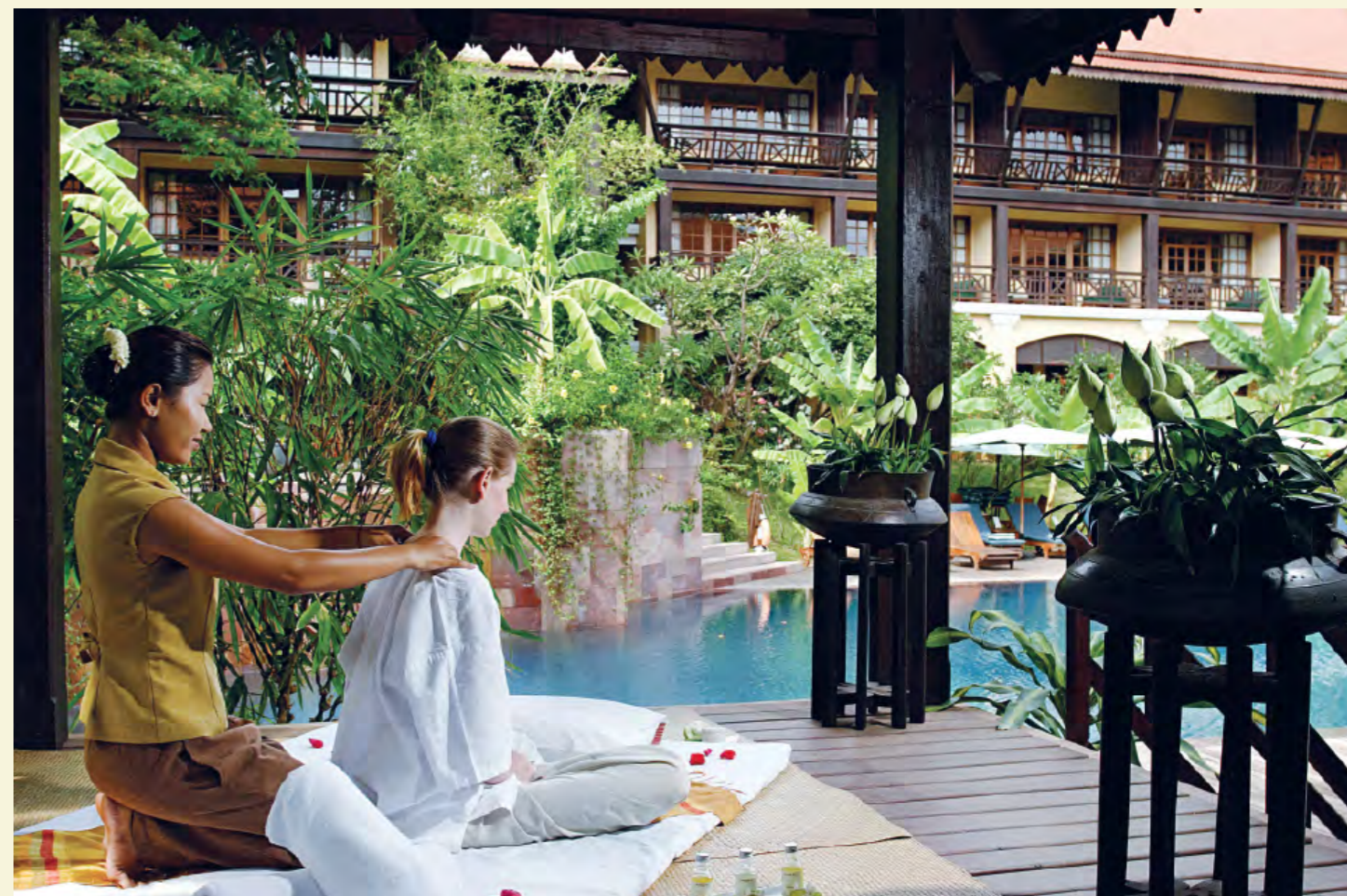
VICTORIA SPA ANGKOR