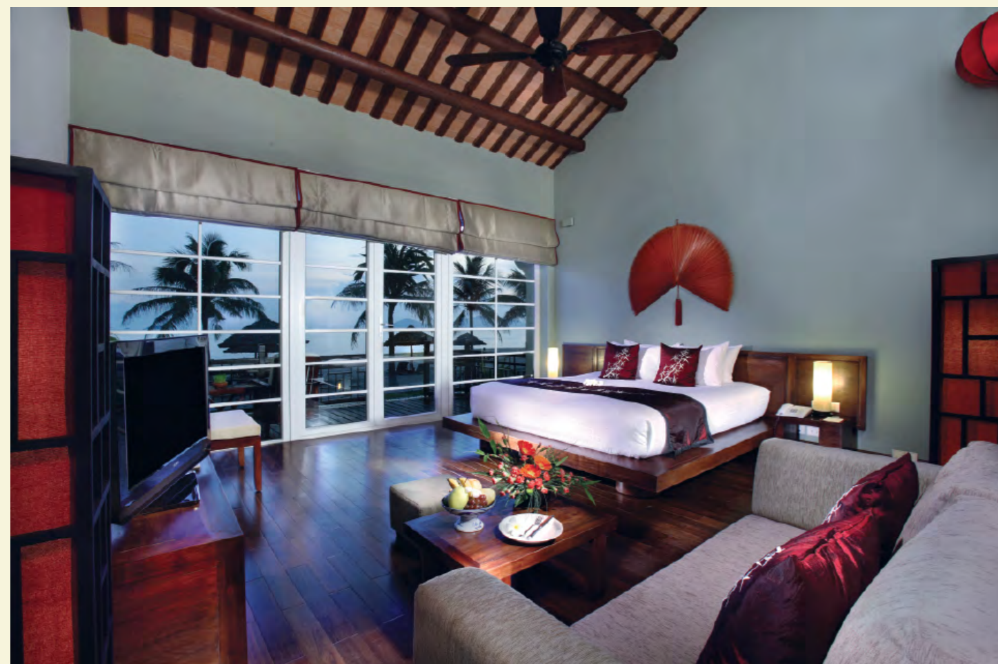
JUNIOR SUITE ROOM